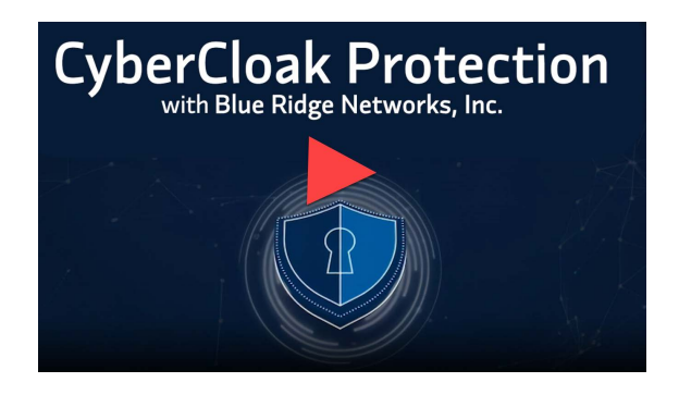
- Joe Weiss (ControlGlobal.com)

"Businesses should ensure "security by design" of their third-party automation partners to ensure that control systems are isolated and that convenient public status report pages are not part of the design."